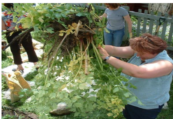
The author struggles with an overgrown monster.

The garden was severely over grown. Giant bunches of Hostas formed massive clumps in several areas. They had the potential to generate dozens of newbies. Unfortunately, the never-ending care for those in need had left little time for the tending required to help the offspring plants develop their own identity. White and purple Phlox had stretched their necks way past the shabby neighboring fence, as they attempted to join the downtown beat with its continuous trek to the waterfront; to the world, outside this one sacred spot. Scattered Bachelor's threw their buttons in random clusters, but were kept at bay with an ever-present Creeping Jenny doing her best to contain this well established flock. Her battle with the Soldiers and Sailors was almost lost, as the boys made aggressive attacks all around the base of the decks and stairs. I worked particularly hard trying to ensure they were put back in their places, which was no small feat as I followed the roots up and under the darkest of corners. A crowd of pink Cranesbills Geraniums kept an ever present vigil; doing their best to stand out and be heard amidst the overpowering grasses and weeds. Their fight was a continuous labour of marches, holding their bright pink signs; refusing to be quieted by the masses who wished no less than their silence.