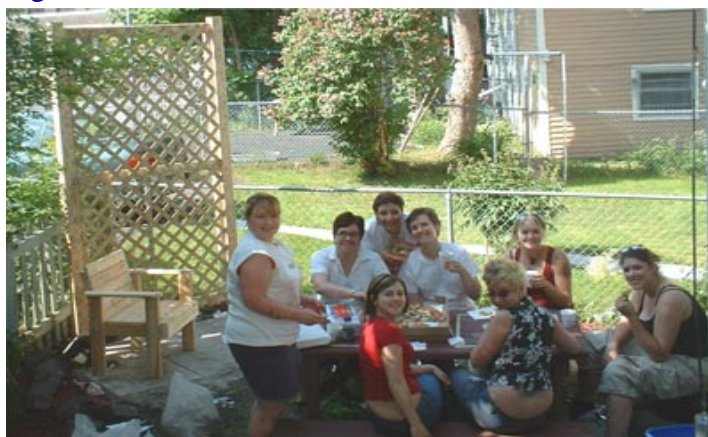
Taking a well deserved break.

As I fitted the last of the stones in place, nailed the last of the flower pots together, I smiled at the thought that maybe, just maybe, my two and half year old little girl will dig up what I worked so hard to plant. Maybe she'll divide the little Astilbie, planted under the abhor, and find a new spot for the Lupines that invariable will overcrowd the Creeping Veronica and create for herself what she needs to be a stronger woman.