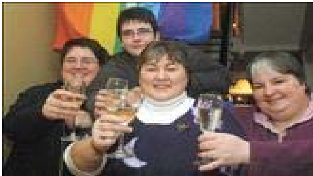
Celebrating a long overdue victory.